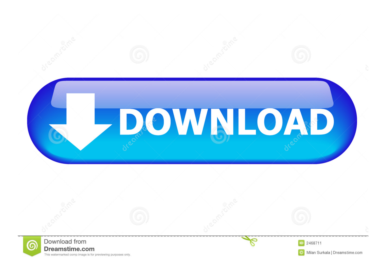
Son Of Satyamurthy Full Movie With English Subtitles 24